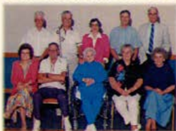
LADBURY FUNERAL SERVICE Dickinson, ND