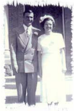
Married June 1, 1948